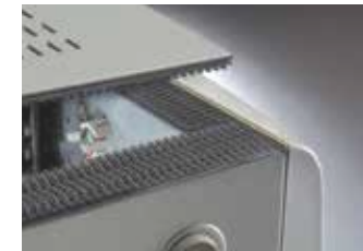
Attach access panels to industrial, electronic, and electrical equipment