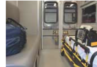
Attach cushioning panels in an ambulance or bus