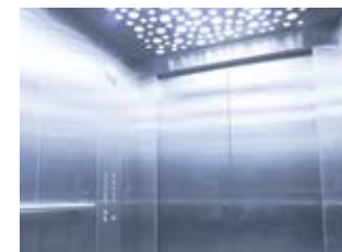
Attach elevator control panel to interior wall