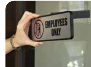
Secure plastic signs to window glass

3M, Dual Lock and VHB are trademarks of 3M Company. All rights reserved. Please recycle. Printed in Australia. © 3M 2015. All rights reserved. AV011442355