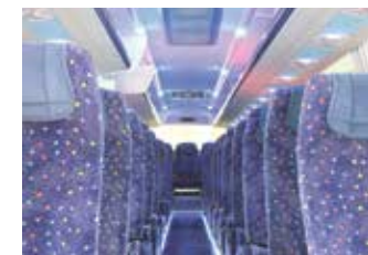
Fasten ceiling panels to interior for future access