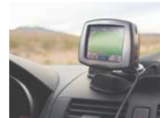
Secure vehicle accessories to dashboard