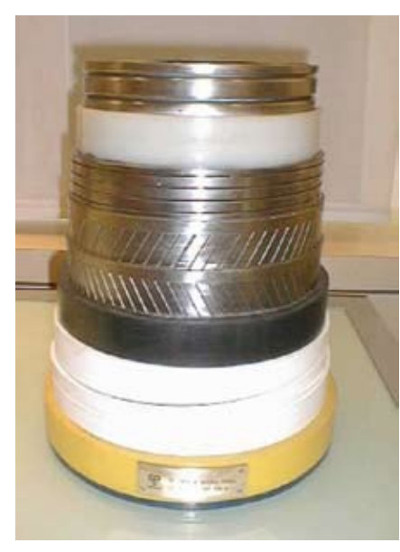
Technip insulated flexible pipe sample wrapped with syntactic tape layers.