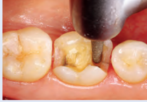
2. Tooth preparation