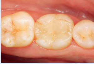
1. Initial situation