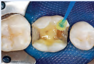
4. Bond with Scotchbond™ Universal Adhesive and RelyX™ Ultimate Adhesive Resin Cement