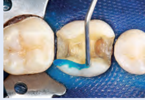
3. Selective etch