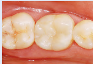
6. Final restoration