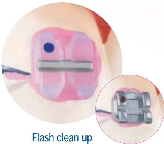
Flash clean up