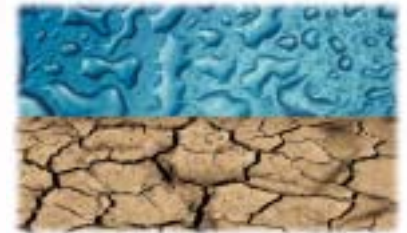
Transbond™ Plus Self Etching Primer is made of a hydrophilic material that performs equally well in either a wet or dry environment.

Since it's the only orthodontic bonding system with an adhesive coating on each bracket, the APC PLUS System needs no adhesive mixing or application. So there's less opportunity for bracket contamination. Add Transbond™ Plus Self Etching Primer that performs under both wet and dry conditions, and you've substantially reduced bonding variables.