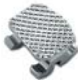
Each pad is 80 gauge woven mesh and yields a strong and consistent bond.

An innovative pad design, incorporating an 80 gauge woven mesh bonding pad, matches up to the curvature of the tooth for maximum contact and strong, consistent bond strength. Research conducted and published by Howard University* reveals shear bond strengths 40% to 50% higher for 80 gauge mesh vs. 100 gauge mesh on bicuspids with macro-filled resins.