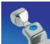
The patented low profile hook and small ball are milled from a single piece of metal for increased patient comfort.

identification system and deep tie-wing undercuts for easy and secure ligation. For ease of use, the brackets have been designed with smoothly finished bicuspid tie-wings that are slightly extended and offset gingivally away from the tooth.