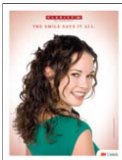
Clarity™ SL Appliance System Poster – Dark Hair Woman