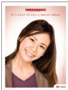
Clarity SL Appliance System Poster – Dark Hair Woman #2