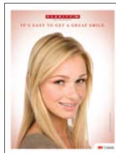
Clarity SL Appliance System Poster – Blonde Hair Woman