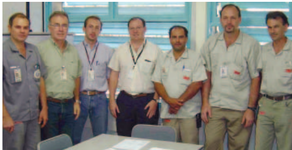
Facility energy teams, such as the Ribeirao Preto team from 3M Brazil, are vitally important to ensure that the company continues to achieve its energy use objectives.