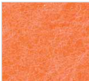
100% synthetic media

Filtrete ring panel filters are just one part of the commercial filtration offering from 3M. Whether your needs include high airflow, high performance, utility or specialty filtration, we would encourage you to talk with your local sales representative regarding 3M air filtration products.