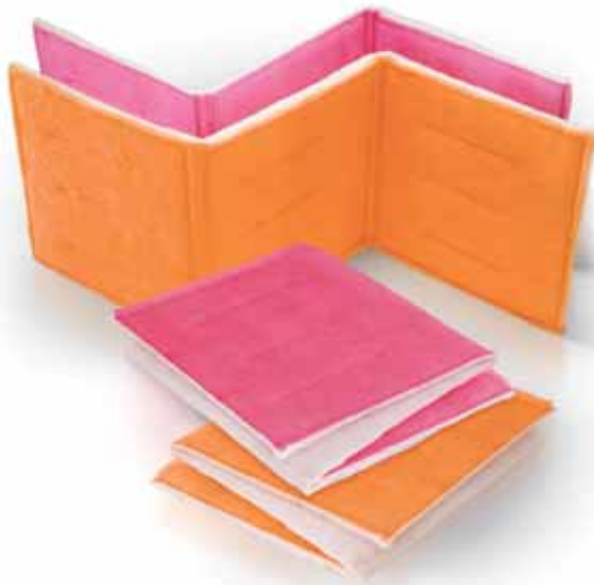
Layered design Internal wire frame Link configuration

Filtrete™ Commercial Ring Panel HVAC filters are available in two grades (Dust and Performance) for your high traffic, large particle applications. Their sturdy ring panel construction provides a lightweight filter that is easy to handle and installs securely into front and side loading filter racks. These filters may be used as primary filters or as prefilters in certain applications. Please refer to your industry specific prefilter guidelines and 3M technical data sheets for detailed product attributes and performance.