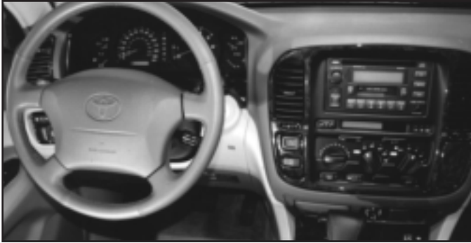
Distinctive Industries' genuine wood dashboard trim attached with 3M™ Acrylic Foam Tape enhances the style of this 1998 Toyota Landcruiser.