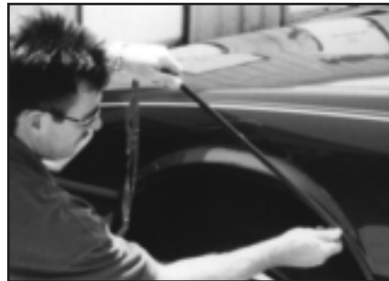
This Toyota Camry features color-keyed fender trim and door edge moldings from Precision-Trim, Inc. — installed with 3M™ Acrylic Foam Tape by Mike's Stripes, of Boaz, Alabama.

According to Owens, 3M acrylic foam tape is the industry standard for attachment of interior wood dash trim. "We have conducted tape tests in our in-house lab as well as in the field, and we use the best tape on the market."