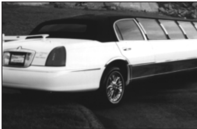
Stainless-steel rocker panels from Professional Trim Products add protection and value, and attach reliably with 3M™ Acrylic Foam Tape.

Screws, rivets and clips were once the customary fasteners for attachment of automotive moldings and trim. However, the use of high performance 3M™ Acrylic Foam Tape to replace mechanical fasteners is rapidly expanding, for both OEM and aftermarket applications.