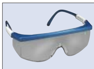
3M™ Protective Eyewear 1710, Black Frame/Clear Lens 1711, Blue Frame/Clear Lens 1712, Black Frame/Smoke Lens

Comfortable, lightweight and designed for worker acceptance.