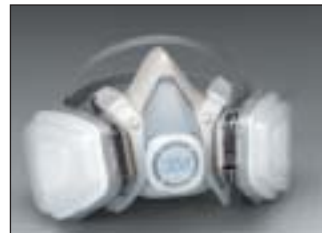
3M™ Half Facepiece Respirator Assemblies 51P71, 52P71, 53P71