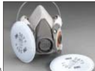
3M™ Half Facepiece Respirators 6100, 6200, 6300