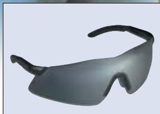
3M™ Protective Eyewear 1720, Black Frame/Clear Lens 1721, Black Frame/Mirrored Lens 1722, Red, White, Blue Frame/Clear Lens 1723, Black Frame/Amber Lens

Wraparound design with a non-slip rubber head grip for added comfort. They have a 5-position adjustable temple and a soft vinyl nose pad.