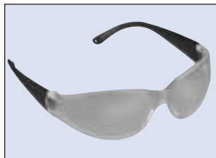
3M™ Protective Eyewear 1700, Black Frame/Clear Lens 1701, Smoke Frame/Smoke Lens 1702, Clear Frame/Clear Lens

Furniture manufacturing, cabinet making and mill working expose workers to a variety of eye hazards. Dusts and flying wood chips are some of the hazards encountered in woodworking and related applications. 3M offers a selection of high quality protective eyewear that can help protect workers from these hazards. Our polycarbonate lens eyewear has front and side protection and is available in several styles. They meet the requirements of ANSI Z87.1-1989 and provide 99% UV protection.