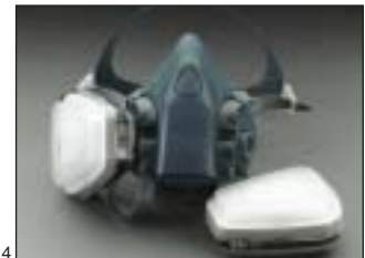
3M™ Half Facepiece Respirators 7501, 7502, 7503