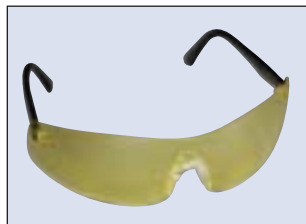
3M™ Protective Eyewear 1740, Black Frame/Clear Lens 1741, Black Frame/ Mirrored Lens 1743, Black Frame/Amber Lens

Wraparound design with a non-slip rubber head grip for added comfort. They have a 5-position adjustable temple and a soft vinyl nose pad.