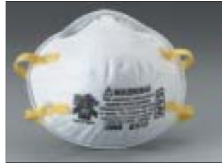
3M™ Particulate Respirator 8210 N95

Sanding, milling cutting, routing and finishing are woodworking functions for which workers should use respiratory protection. 3M is a world leader in the design and production of respirators for these applications. Whatever the job, 3M can provide a respirator that can help protect the worker from the hazards encountered. From filtering facepiece respirators to specialized gas and vapor respirators, 3M can meet the needs of the woodworking markets.