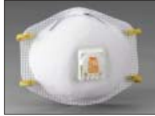
3M™ Particulate Respirator 8511 N95