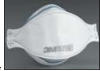
3M™ Particulate Respirators 9210/9211 N95