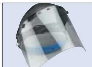
3M™ Face Shield Kit 1631

Stylish, one-piece wrap-around design for good looks and optimal protection. They have 4-position temple adjustment and a vinyl nose pad for greater comfort.