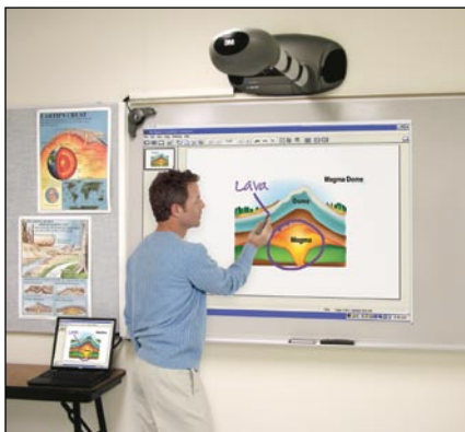
3M™ Digital Media System 800

3M Vikuiti Super Close Projection marks the next generation in classroom presentation technology. Among its many features, teachers and students truly appreciate that 3M Vikuiti Super Close Projection literally takes them out of the light. This technology can be found in the 3M™ Digital Media System 700, 800 Series and 3M™ Digital Wall Display 9000 Plus Series products.