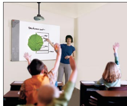
3M™ Digital Media System 700