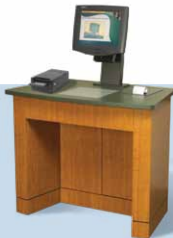
3M™ SelfCheck™ System R-Series with the 3M™ Integrated Disc Media Unlocker