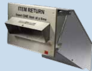
3M™ SelfCheck™ System C-Series