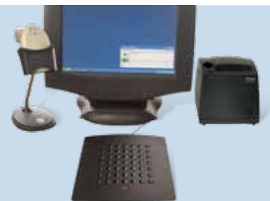
3M™ Pad Staff Workstation