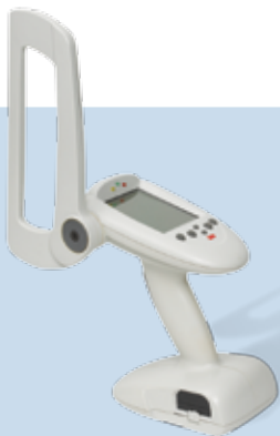
3M™ Digital Library Assistant

Here's the bottom line: 3M RFID Systems typically pay for themselves in two or three years. They then provide positive returns for the many years they continue to operate.