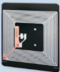
3M™ RFID Tag

Few technologies can help solve as many challenges as 3M's RFID solutions. You can help ensure a seamless workflow with the integration of RFID technology. The 3M™ RFID System will help make the most time-consuming tasks—check-ins, checkouts, searching for holds or lost items, and shelf management—almost effortless; establishing an unwavering increase in performance and accuracy.