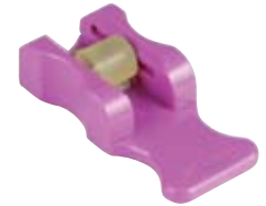
Easy Roller (1 each) 712-093