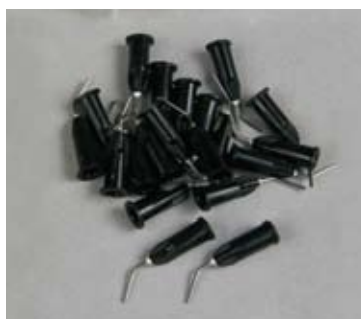
Disposable Metal Dispensing Tips 20/pk 712-045