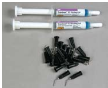
Transbond XT Etching Gel System (Blue Tint) (35% Phosphoric Acid) 2 gel etch syringes (3.5g each) 20 disposable metal dispensing tips 712-044