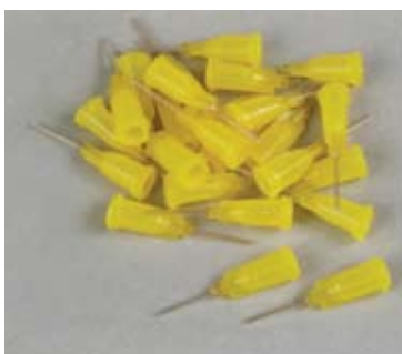
Disposable Plastic Dispensing Tips 25/pk 712-037