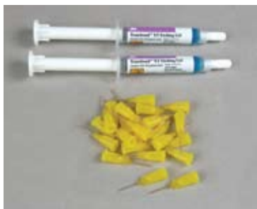
Transbond™ XT Etching Gel System (Blue Tint) (35% Phosphoric Acid) 2 gel etch syringes (3.5g each) 25 disposable plastic dispensing tips 712-039