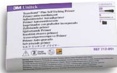
100 unit box 712-090

Easy-to-use Transbond™ Plus Self Etching Primer lets you etch, prime and bond enamel in one simple step. A single-patient use foil pack contains pre-measured etchant and light cure primer that are applied together using a disposable applicator included with each pack. Works in both moist and dry environments with outstanding bond strength when used with moisture tolerant adhesives. Contains fluoride. Each unit contains enough primer for a complete arch. Use with light cure adhesives.