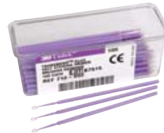
Standard Applicators (100/pk) 712-092