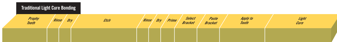
Traditional Light Cure Bonding = 11 steps.