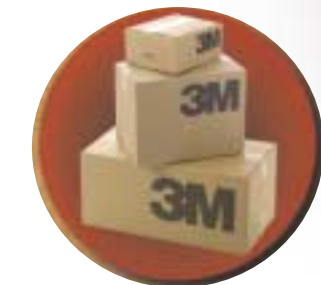
Box Capacities Length: 6" to no limit Width: 6" to 22.5" Height: 3.5" to 22.5"