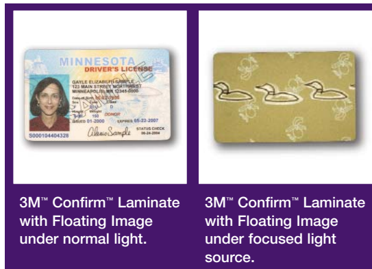
3M™ Confirm™ Laminate with Floating Image under normal light.

Most over-the-counter ID issuing systems use an extremely durable and long-lasting material for their cards. New 3M innovations have made both Confirm Laminate and Confirm Laminate with Floating Image available on a composite card. The result: you can now make your driver's licenses, national ID cards, health cards and other ID cards as impossible to tamper with or counterfeit as passports and other secure documents—and much easier to authenticate.