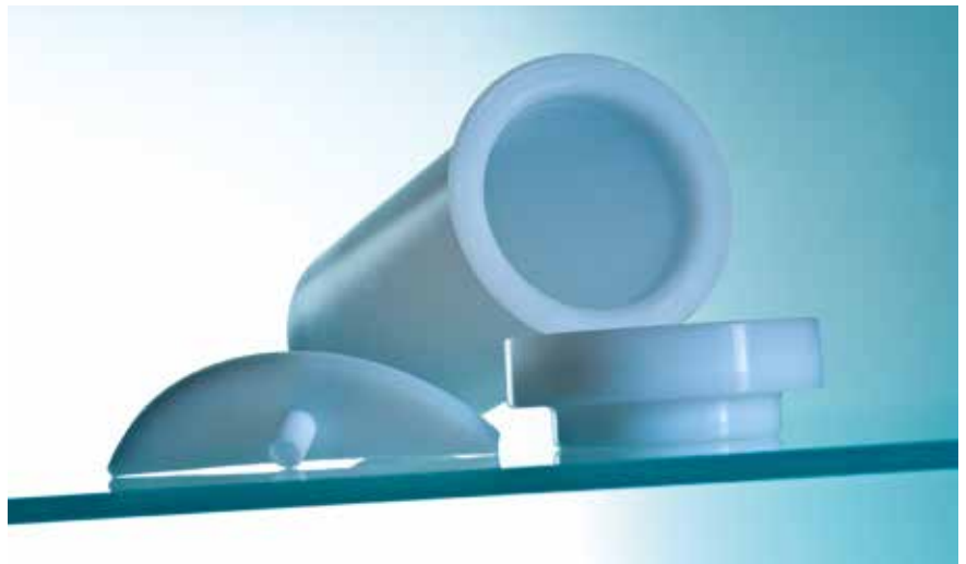
The Up-Cycling plant will initially process clean fluoropolymer materials, i.e., wet waste, off-specification materials of unfilled PTFE from manufacturers, and unfilled PTFE scrap

Polytetrafluoroethylene (PTFE) is not processed using traditional thermoplastic methods such as injection molding or extrusion, but predominantly using a complex pressure sintering method followed by a machining process to produce the final part geometry. Owing to the large amounts of waste generated during production, and also as a result of the relatively high polymer price, a recycling industry sprang up in this sector at an early stage. Specialized companies recycle ma-