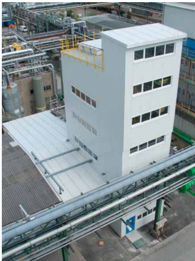
Fig. 1. Pilot plant of Dyneon for Up-Cycling of end-of-life fluoropolymers with an annual capacity of 500 t

The new high-temperature recycling process includes a grinding stage, after which the PFPs, which are preferably end-of-life products, are decomposed into their monomers at temperatures above 600°C. These monomers are the same chemical components from which the polymers were produced. This process called 'pyrolysis', primarily produces tetrafluoroethylene (TFE) and hexafluoropropylene (HFP) with a recovery rate of 90–95%. The resulting