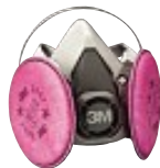
Welding Reusable Respirator 6297-W with Odor Relief