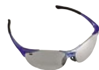
Protective Eyewear 1752 Blue Frame Mirrored Lens

Note: Depending on the specific conditions of each work site and methods used, welding activities have the potential to expose workers to harmful levels of welding fumes, gases, or other airborne contaminants.