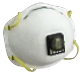
Particulate Welding Respirator 8515 N95 with Cool Flow™ Valve