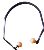
Banded Hearing Protector 1310