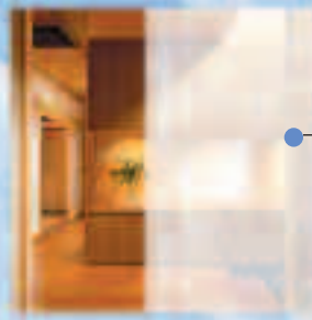
Sagano: subtle crosshatch pattern creates an icy illusion Product size: 50" x 98.4'

At a fraction of the cost of etched-glass, Fasara films are perfectly suited for interior glass partitions or the inside surface of windows. Available in several textures which can be die-cut for highly customizable designs, Fasara films can be used to create a more private atmosphere or a more dynamic aesthetic.