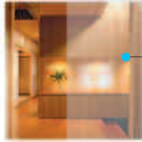
Oslo: creates a masking, slightly textured fog Product size: 50" x 98.4'