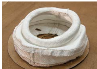
Tadpole gasket made from 3M™ Nextel™ Ceramic Fabric used in high temperature furnace door*