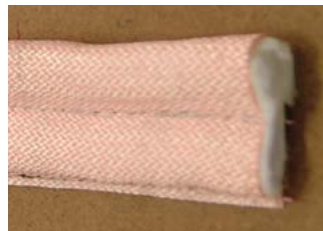
Cone tadpole seals made from Nextel fabric (BF-20)*