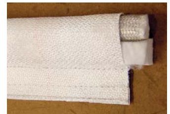
Tadpole seal fabricated from Nextel ceramic fabric*