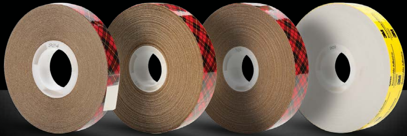
Scotch® ATG Adhesive Transfer Tape 924