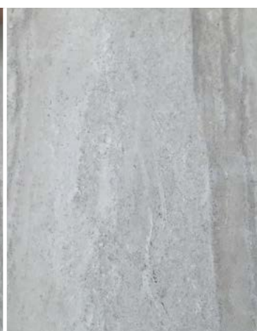
Repair and patch. DI-NOC<sup>™</sup> brand repairs are easy to complete and virtually invisible at normal viewing distances.