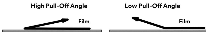
Figure 1. Angle of Pull-Off

The speed, or rate, at which you pull off the graphic can affect how much adhesive residue remains on the substrate. Some films can be pulled off quickly, or “snapped” off. Brittle films can sometimes be peeled off slowly.