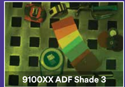
9100XX ADF Shade 3

Improved optics in the new 3M™ Speedglas™ Welding Filter 9100XXi provide more contrast and natural-looking color, as shown by these photos.