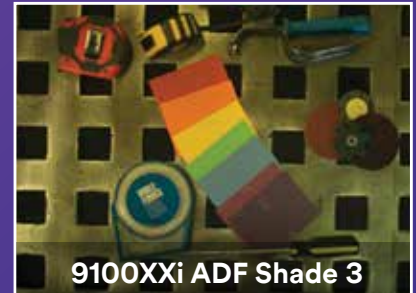
9100XXi ADF Shade 3