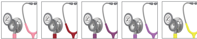
5633 Pearl Pink 5627 Burgundy 5831 Plum 5832 Lavender 5839 Lemon-Lime