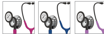
5862 Raspberry 5863 Navy 5865 Lavender