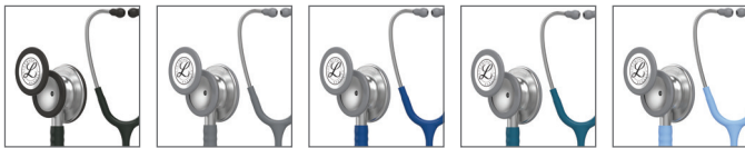
5620 Black 5621 Gray 5622 Navy 5623 Caribbean 5630 Ceil Blue