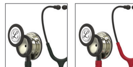
5861 Black 5864 Burgundy