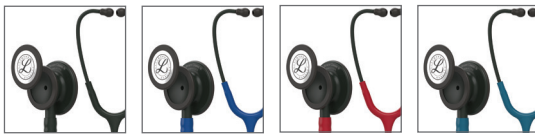
5803 Black 5867 Royal Blue 5868 Burgundy 5869 Caribbean