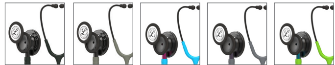
5811 Black 5812 Dark Olive 5872 Turquoise 5873 Gray 5875 Lime Green